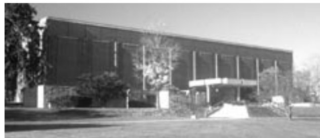
Bristol Gymnasium—"Home of the Statesmen"