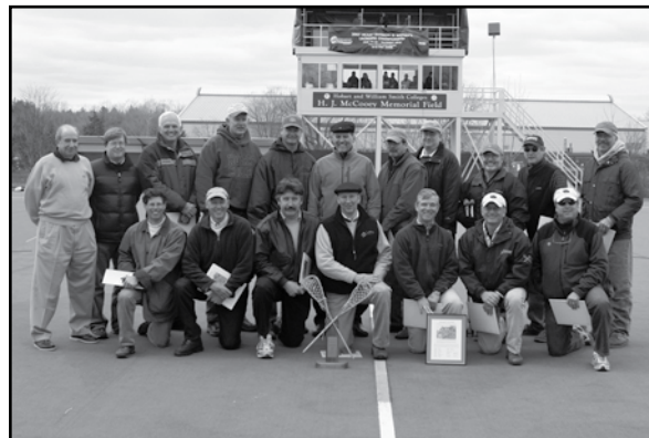
The 1972 National Champion Statesmen were named a Hobart Team of Distinction on April 14, 2007.