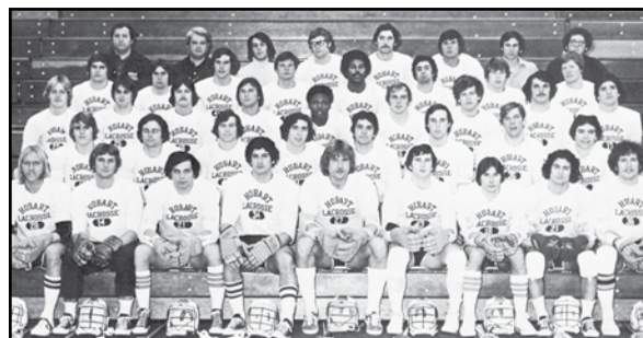
1977 Division II National Champions