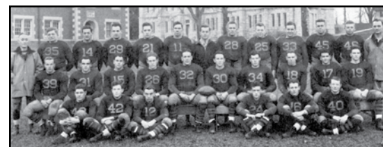
The 1936 Hobart "Statesmen"

And with those two references, Hobart College had a nickname.