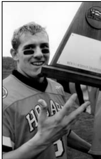
SPENGER TULSIFINGER LAKES TIMES