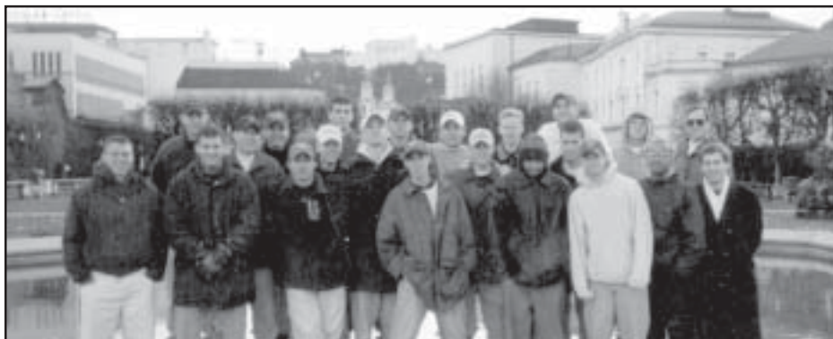
Hobart basketball in Germany, 1994-95