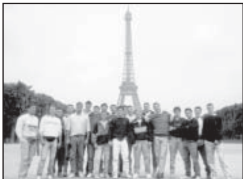
Hobart basketball in Paris, France, 1990