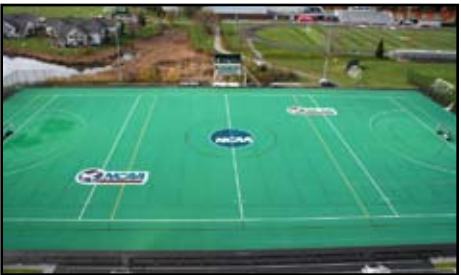
McCooey Field sports freshly painted NCAA logos in preparation for the 2006 Field Hockey Championship. The venue also will host the 2007 Lacrosse Championship (see story below).